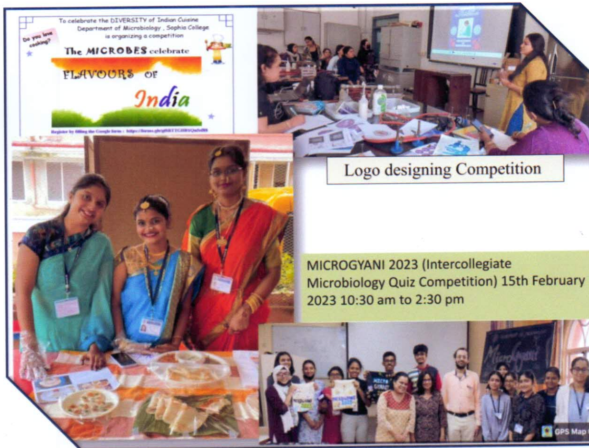
Logo designing Competition

MICROGYANI 2023 (Intercollegiate Microbiology Quiz Competition) 15th February 2023 10:30 am to 2:30 pm