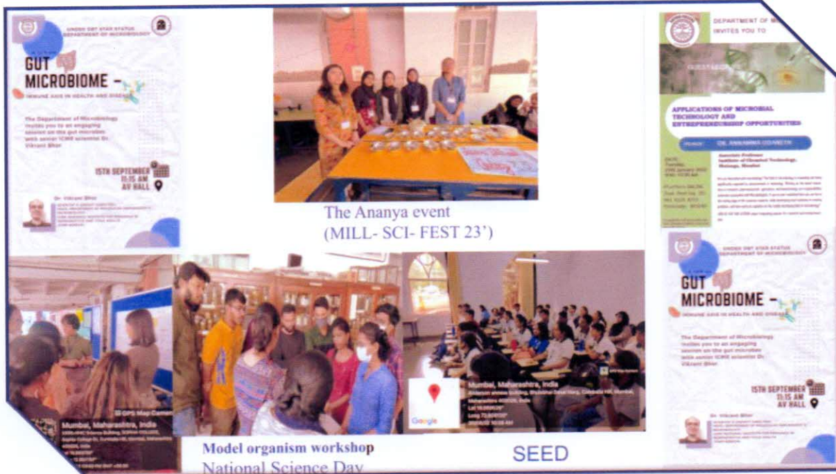
The Ananya event (MILL- SCI- FEST 23')